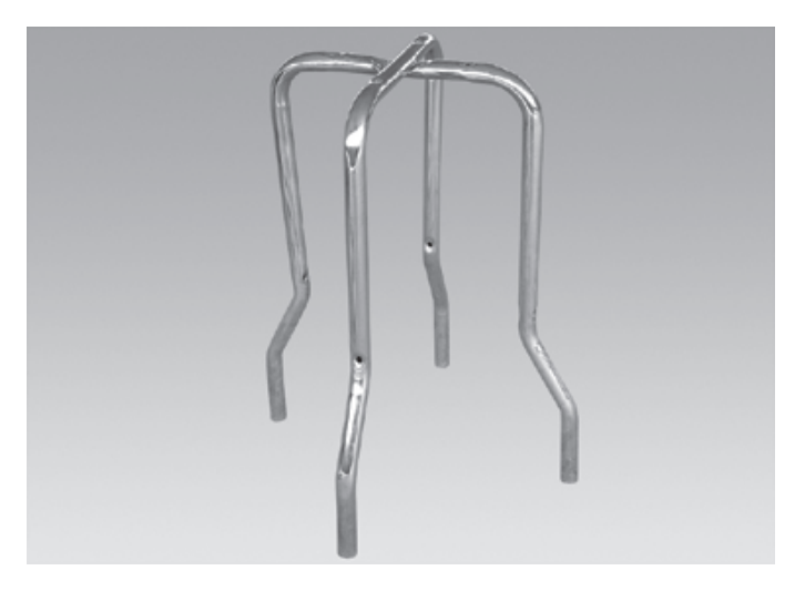
Step 1: Place the two bar stool legs together as shown in the photo.