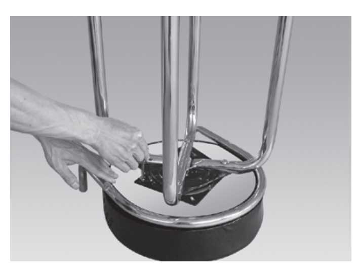
Step 4: Turn the bar stool over and secure the seat to the swivel with medium bolts as shown in the picture.