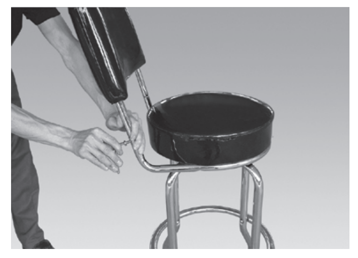
Step 5: Slide the backrest into the tubes and secure with small bolts. Double check all nuts and bolts for tightness.