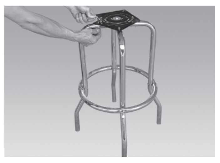
Step 3: Place swivel on top of legs and align holes. Insert large bolts and screw on lock nuts securely.